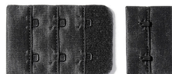
CUT2 H&E 3x2 - 38 mm