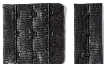
CUT3 H&E 3x3 - 57 mm